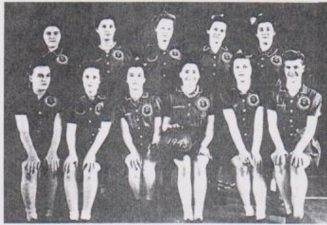
A Fairbridge Basketball Team. Winners of the British Columbia Championship.