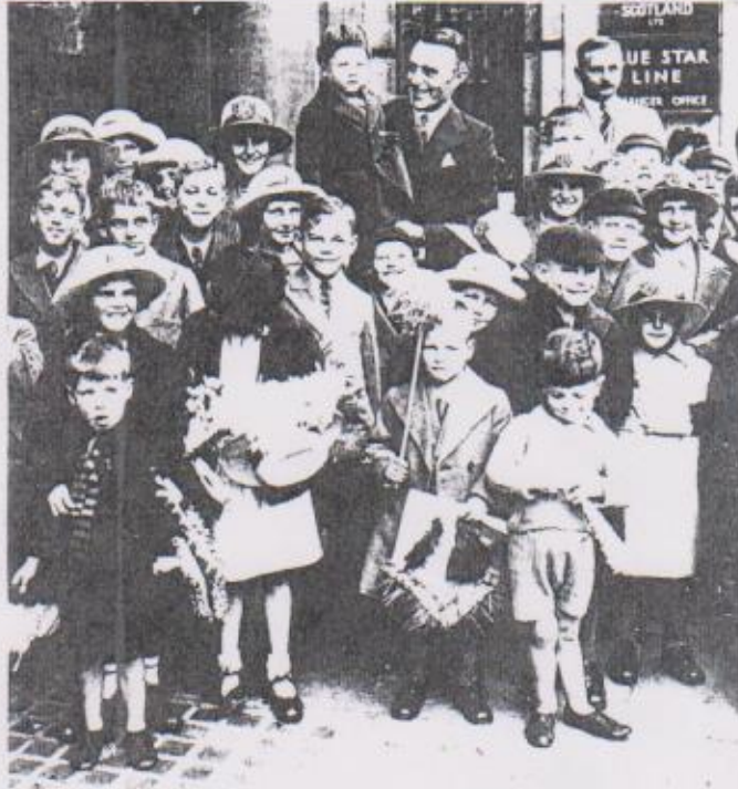
Some of the "Originals" at B.C. House, London, September, 1935

Wine and Cheese party, Village Green, 6 pm, Friday. Open Meeting, Saturday, 10-12 am Visit to Fairbridge, Saturday, 1:30 to 4:30 Banquet, Village Green, Saturday, 7 pm.