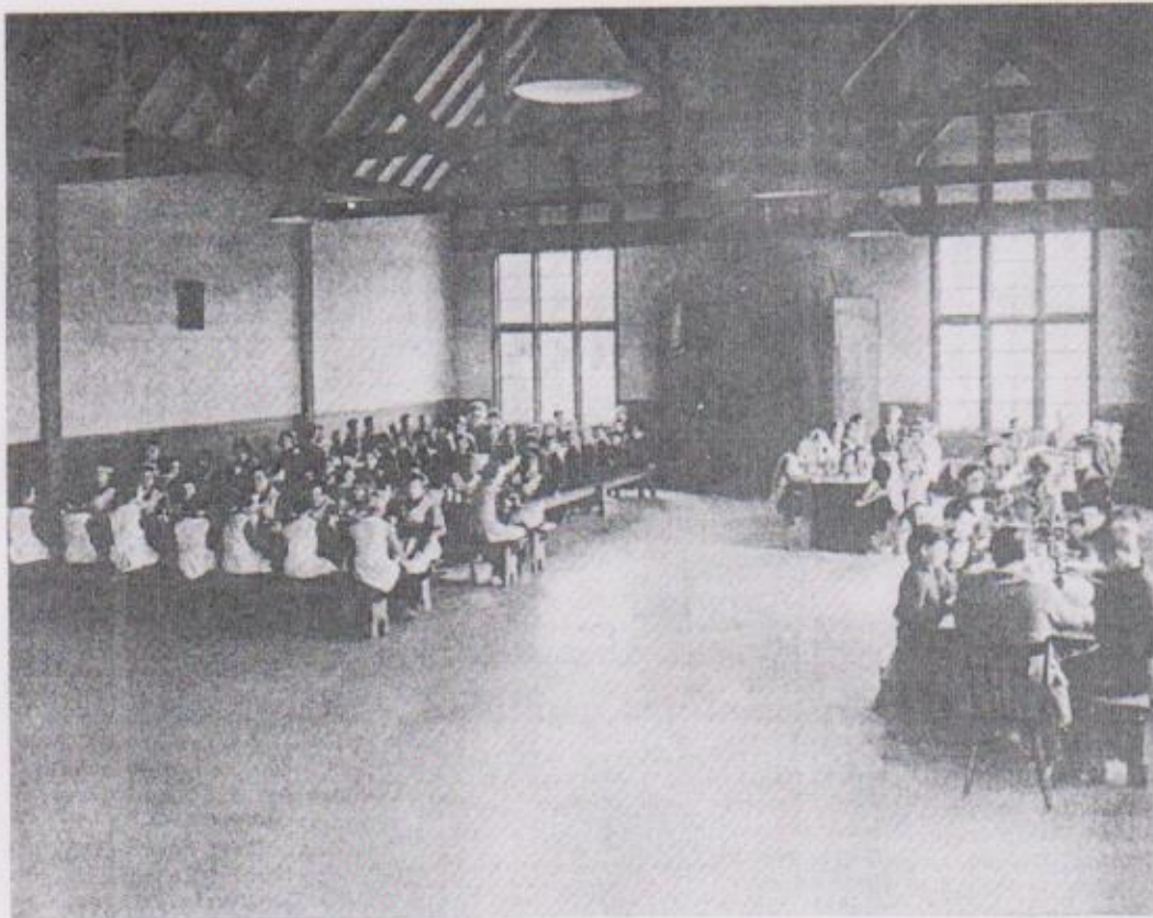
Interior of Dining Hall—Prince of Wales Fairbridge Farm School.