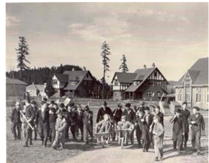
The Boys by the Cottages (Tich Harding's photos)