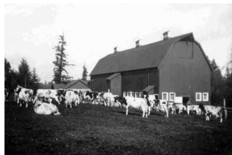
The Cow Barn