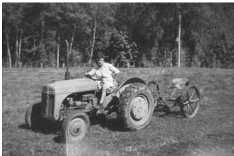
Ken Armstrong Photo